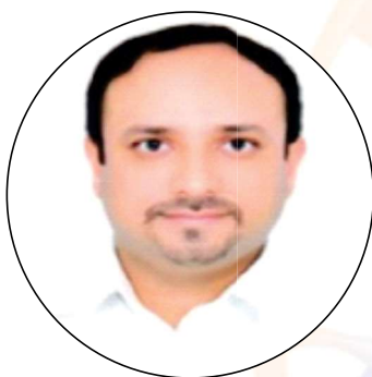
Image-guided surgery, surgical navigation, minimally invasive surgery, medical image processing